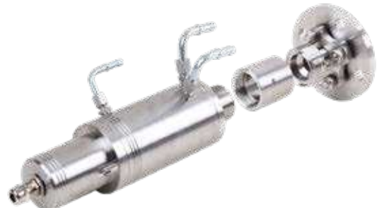
Series 54/55 with cooling jacket including air purge, sleeve for ball flange and ball flange