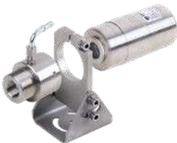
Series 54/55 with air purge unit and adjustable mounting angle